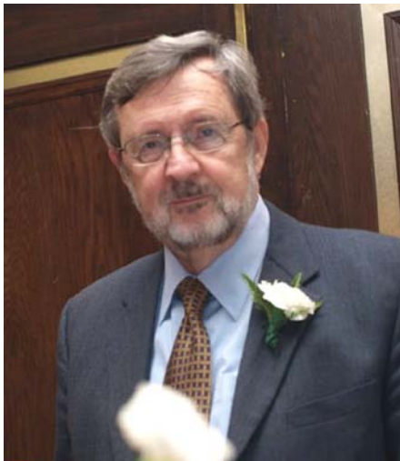
Congressman David Obey Wisconsin 7th Congressional District